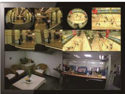
2 Panoramic + 2 Normal cameras