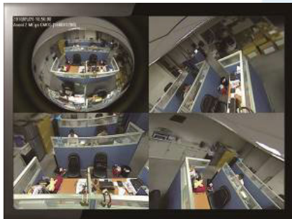
1 Panoramic camera