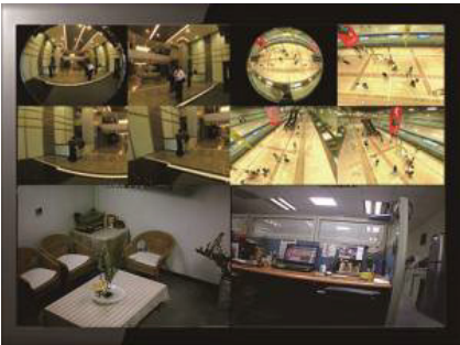
2 Panoramic + 2 Normal cameras