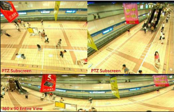
Global 2D + Two 3D-PTZ