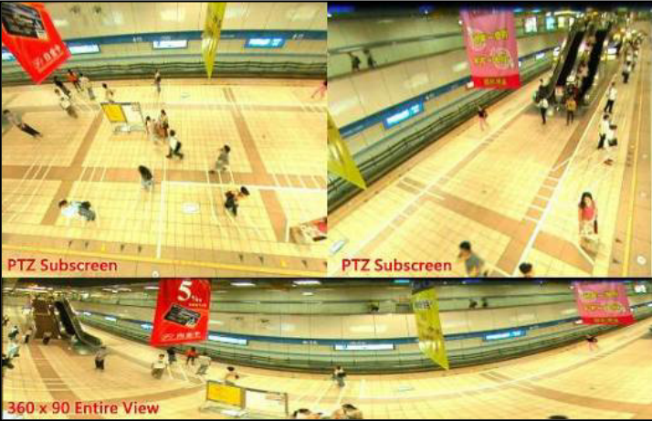
Global 2D + Two 3D-PTZ