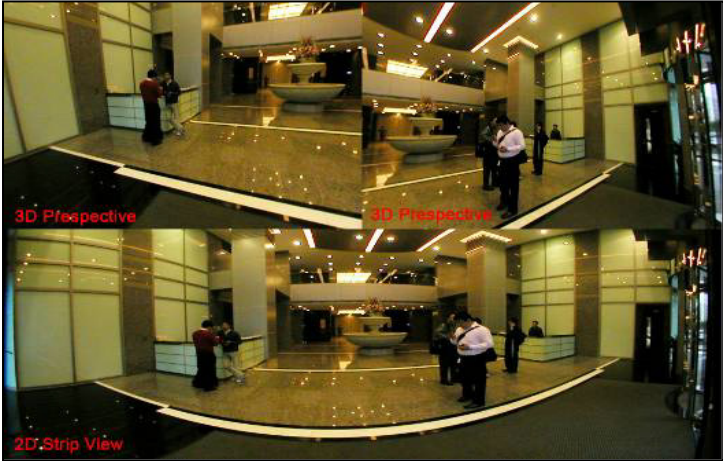
2D Strip View + 3D Perspective