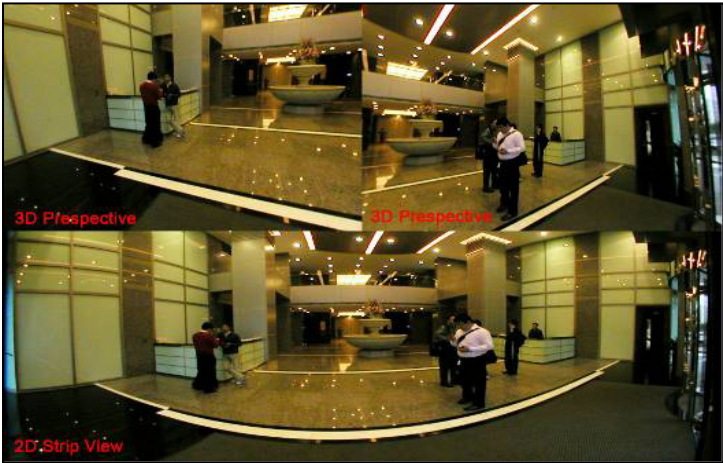
2D Strip View + 3D Perspective