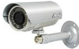
Outdoor IR Camera