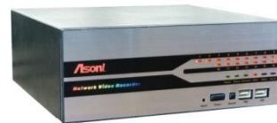
Standalone NVR, Standalone Windows XP Embedded NVR