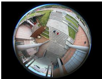
360/180 Degree Panorama Surveillance