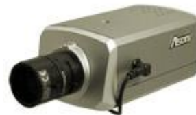
Mega-Pixel IP Camera